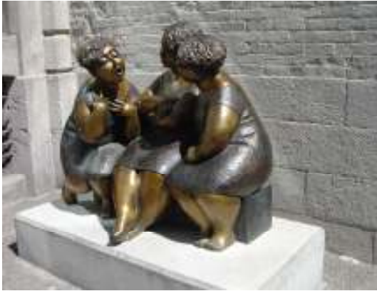
Does this look like any of us?