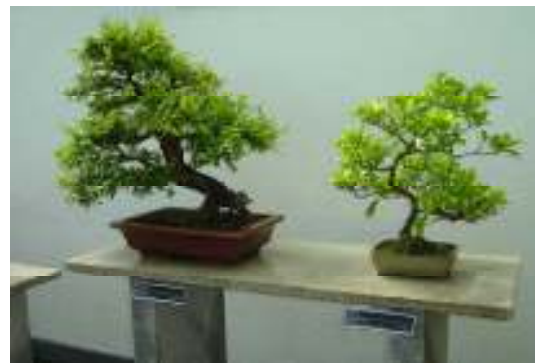
Bonsai at the Botanical Gardens. The tree on the left qualifies for 55+ membership. It's 105 years old.