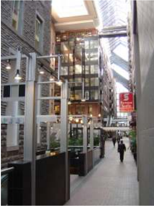
The City of Montreal