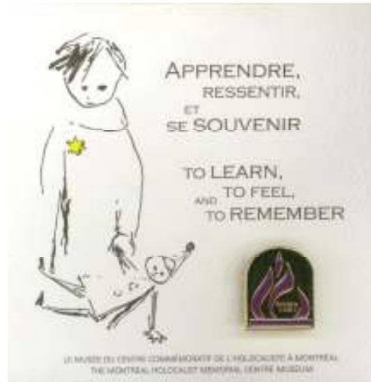
The Holocaust Museum