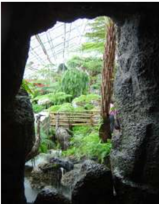
The Botanical Gardens