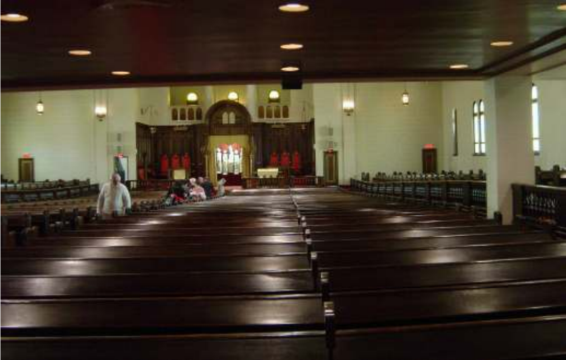
The Main Sanctuary seats about 1700