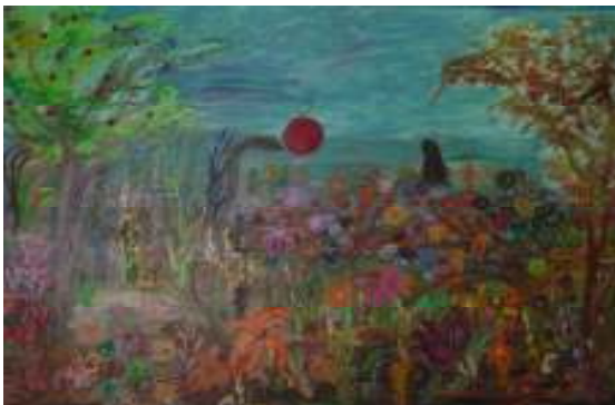
A wall hanging of the Garden of Eden.