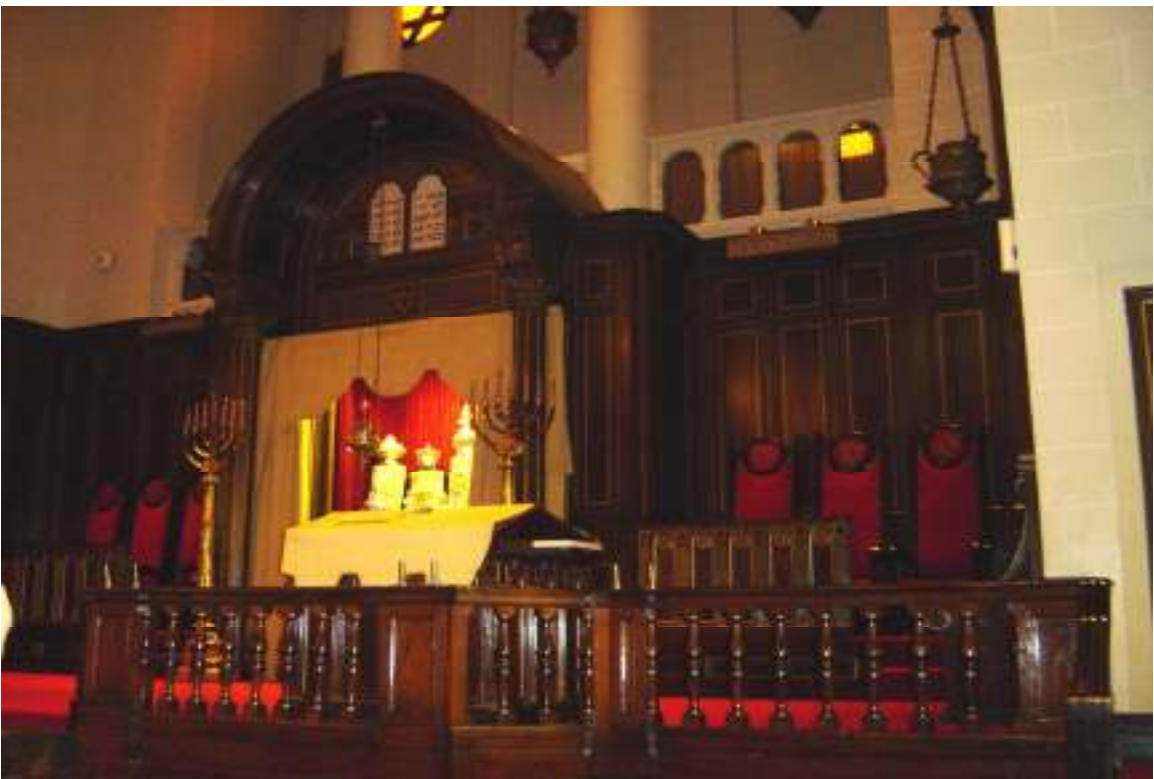
The Bima of the Main Sanctuary.