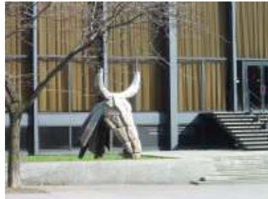
A goat, "Azazel?" at the Bronfman Museum