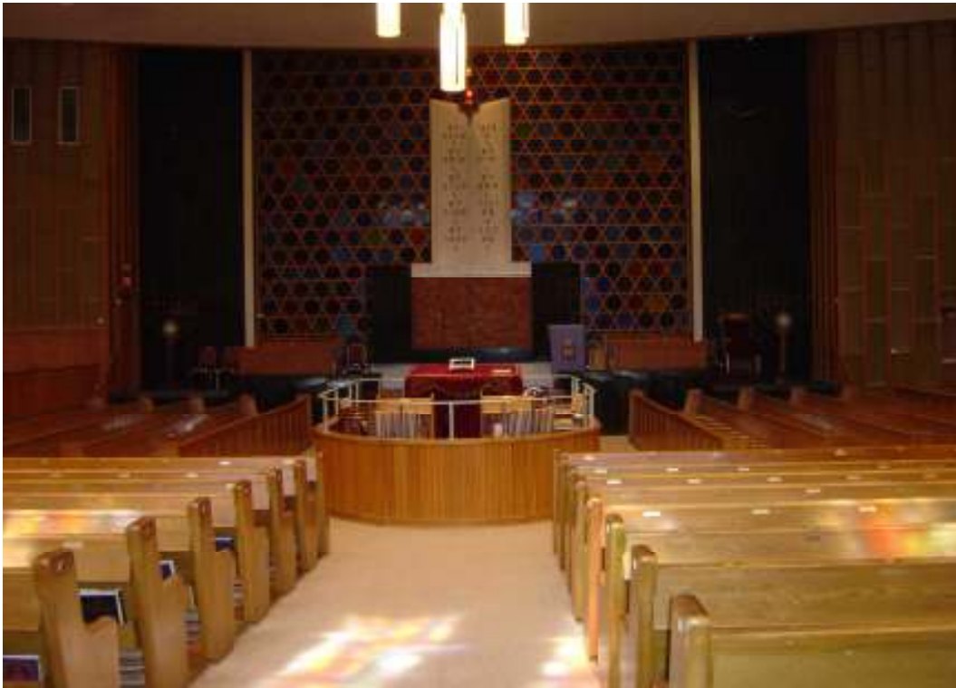
The Main Sanctuary.

The Associate Rabbi gave us a tour. Here he shows us a Sephardic style Torah scroll, enclosed in an ornate case. The parchment itself is rolled by hand.