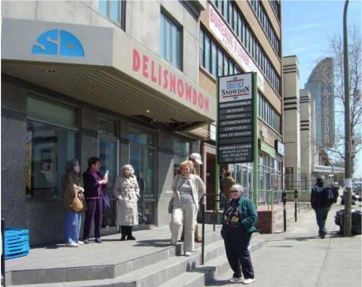
The Snowdon Deli and Montreal's famous Smoked Meat Sandwich (Romanian Pastrami)