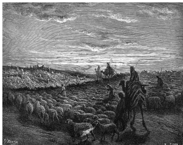
Abram Journeying into the Land of Canaan (engraving by Gustave Doré from the 1865 La Sainte Bible )

the land of your birth, your father’s house to the land that I will show you.”