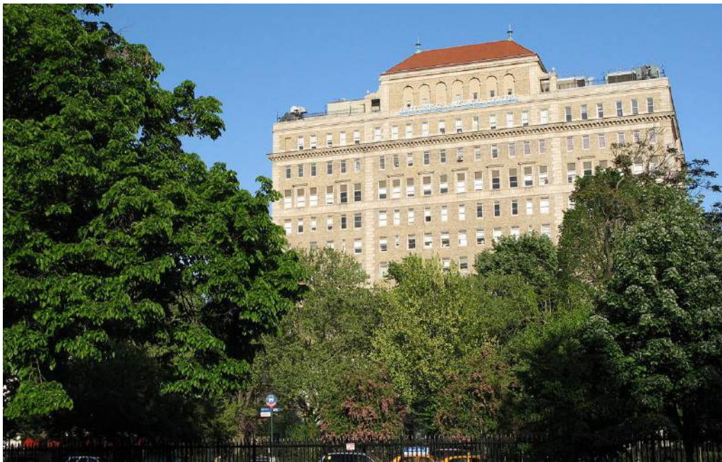
The Dazian Pavillion of Beth Israel Medical Center at 10 Nathan D. Perlman Place between 16th and 17th Streets, Manhattan, New York City.

One summer I worked for 400 hours learning how to be a chaplain, taking a unit of what is called: Clinical Pastoral Education at Beth Israel Hospital in NY.