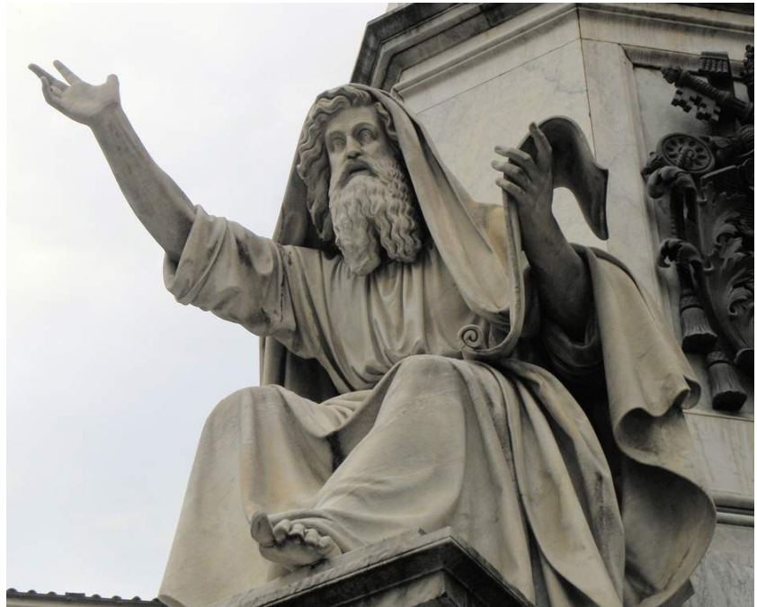
The prophet Jeremiah at the foot of the Colonna dell'Immacolata, at the end of the Piazza di Spagna, Rome (1857).

““Before I created you in the womb, I selected you; Before you were born, I consecrated you; I appointed you a prophet concerning the nations.’